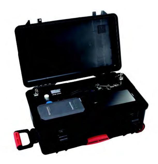
Optional hard shell carrying case