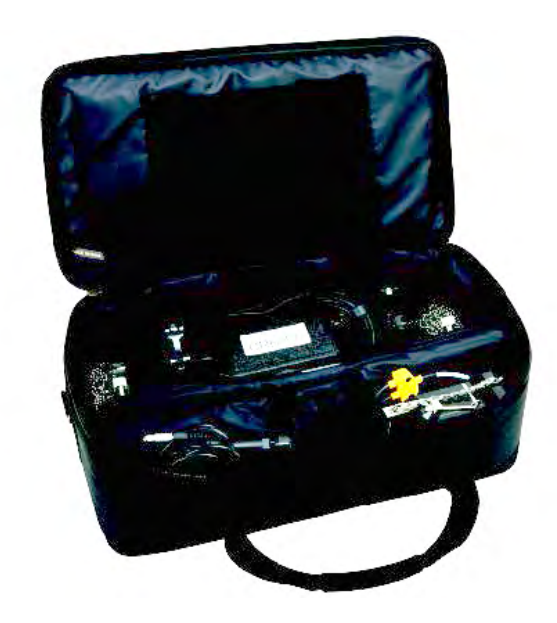
Standard soft shell carrying case