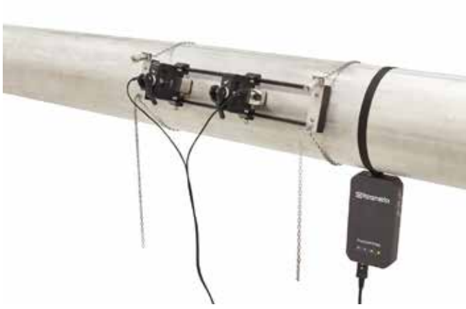
Clamping fixture, transducers and transmitter mounted on pipe