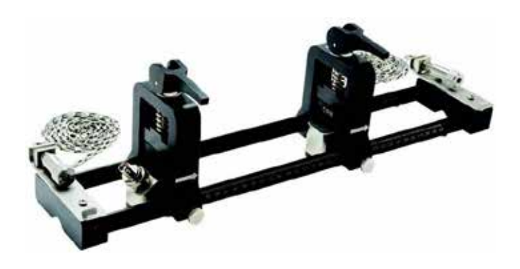
Clamp-on fixture with CRR transducers