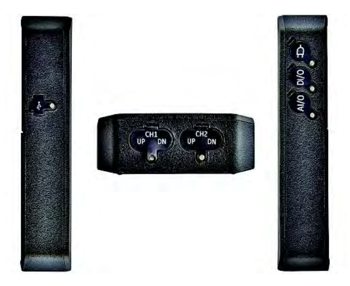
Transmitter electrical connections